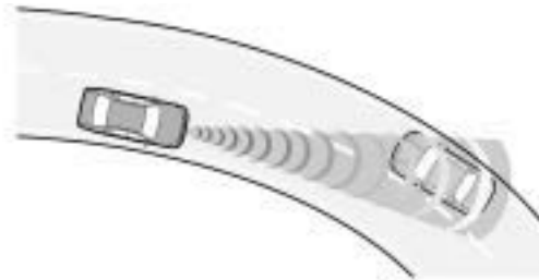
Opposing traffic vehicle during cornering